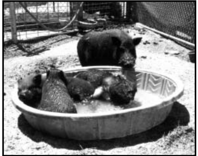
Baldwin Boys Enjoying a Dip With Dad Looking On

that another attempt was worthwhile. We strengthened the pen and returned to Ironwood with mixed emotions.