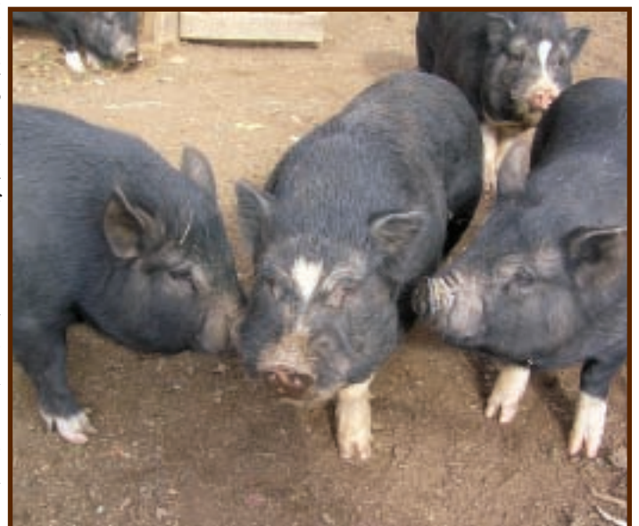
Dad (Center) And Two of His Sons