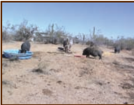
Pigs Enjoying Their New Expansion Field

A fter several months and interruptions our pigs who have been waiting patiently and not so patiently in pens have finally been moved to their new large field and freedom. Everything was finally in place with piped-in water, shelters and shade, blankets and hay and even feeding troughs. We moved 11 pigs out to the new field. I wish I could say and they lived happily ever after. But, of course, that is not the case. It takes weeks and sometimes months before they