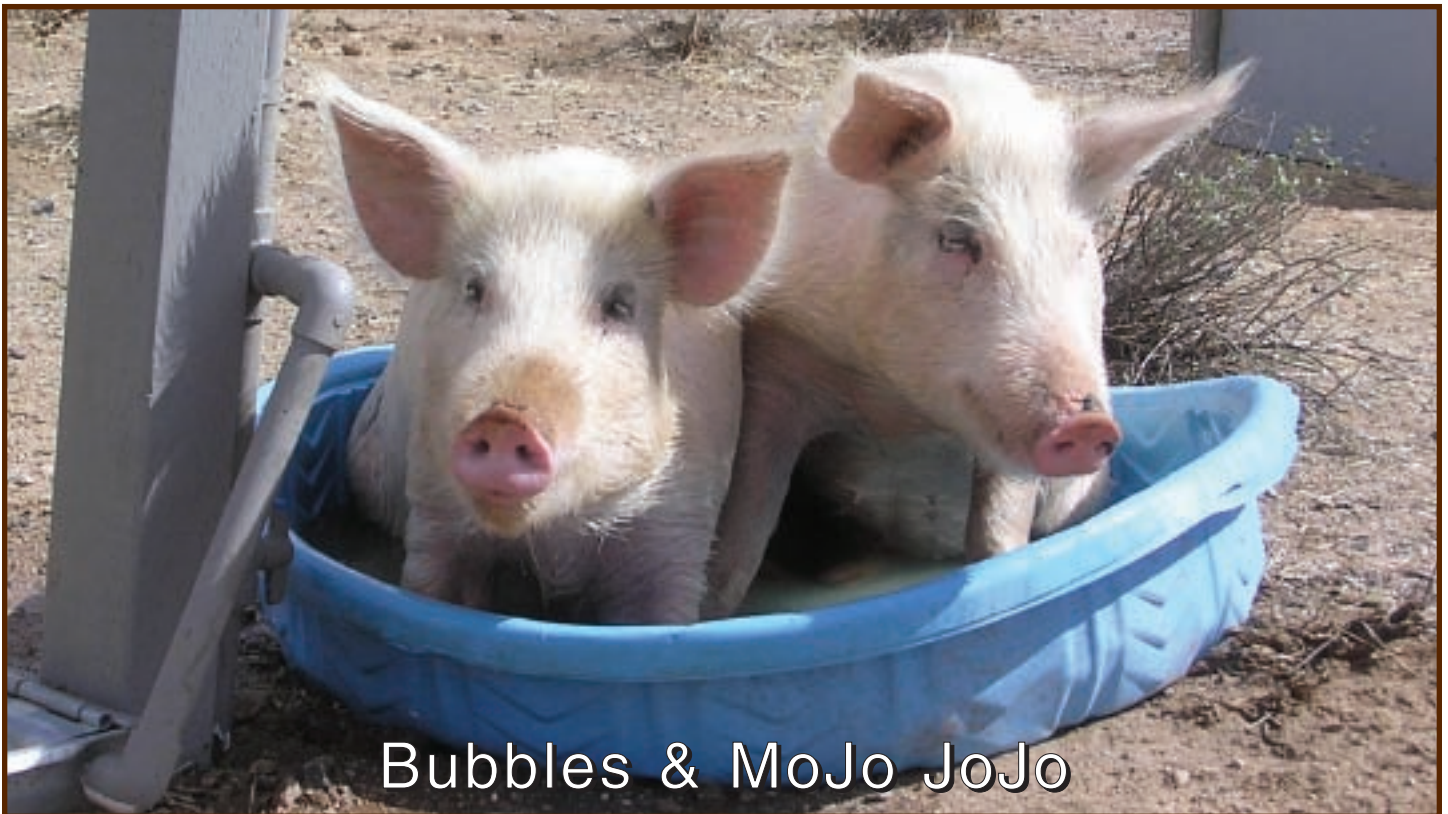
Bubbles & MoJo JoJo