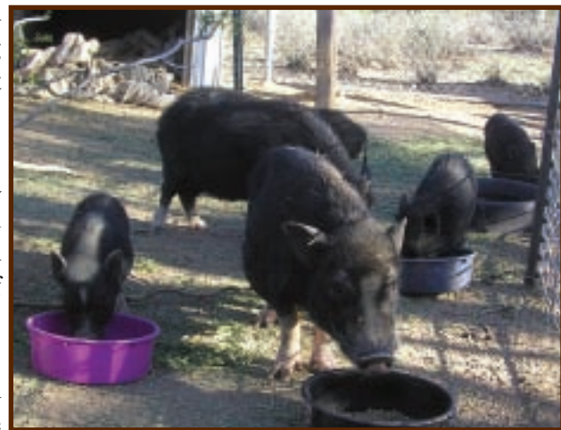
Rescue Seven Getting Their First Meal at Ironwood

Well I had learned as best I could from the previous auctions. I just