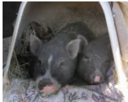
Roger Dodger, Dumpster Rescue, and Screech, Smallest of First Three, Comfort Each Other

lived in the area and was able to find and buy the pigs from the feed store and also pick up the baby. She kept them safely for us until we were able to pick them up a few days later.