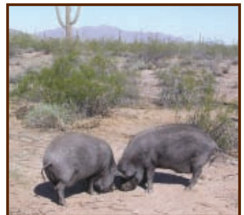
Pinky & Wilbur In Their New Field

And Wilbur and Pinky, our Yucatan, were also moved out of their pen and over to the remaining four acres. They now have the largest field of all and just love the freedom to roam and not have to go back to their pen ever again. They were a bit nervous the first night wondering where the heck they were and what was going to happen next. But once they understood the food was still supplied and they were not forgotten, they soon relaxed and went off to explore their new digs.