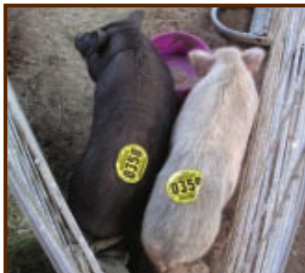
First Two Girls Rescued at The Auction

It all started when we received a call from a woman in Cornville, Arizona, who had taken 2 males and 1 female from a friend and now couldn't keep the pigs due to a complaint from her neighbor. When we hesitated for a couple of days, she gave the pigs to a feed store for sale. We were very concerned because the young female was old enough to be pregnant. The woman wouldn't cooperate with us by telling us the name of the store so we could buy the pigs. We also received a call the same day about a baby pig in the same area that had been abandoned near a dumpster. The woman and her friends were able to catch the baby after trying for 4 days. Shorty, a woman who had adopted a pig from Ironwood,