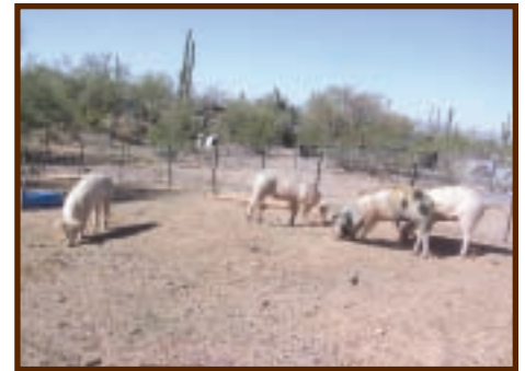
Hoglets In Their Own Field

We have also moved our “babies,” the hoglets we have reported on since last summer, to their new field as well. They had to give up the very large field we built to make room for the subdivisions, but they have a large area in which to run and have been busy clearing the land for us, which we don’t really appreciate. We have referred to them as the “babies” for so long, it is hard to change how we think about them, but they will soon be a year old and well beyond the baby stage of