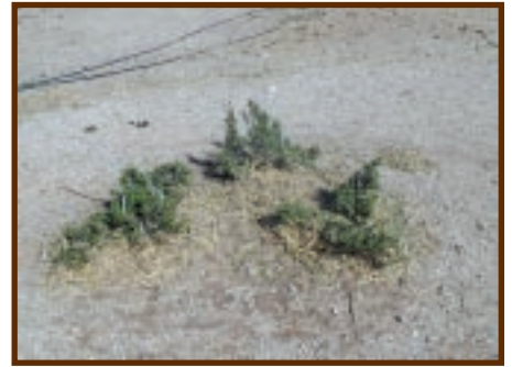
What Remains Of a Cresote Bush