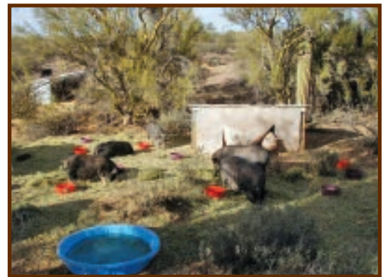
Special Needs Field In 2002

field and make a smaller area for these pigs which we called our Special Needs Field. Later we took in a group of very thin pigs and fenced off the West Field for them so they could be fed extra rations easily without