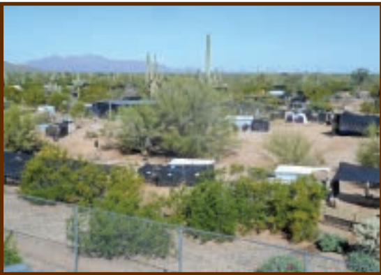
Main Field Today

B ack in the spring of 2001 we were working hard to enclose nearly six acres with six-foot chain link fencing with visions of pot bellied pigs dancing in our heads. When the pigs began coming in June of that year we