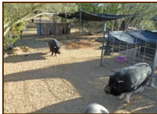
Special Needs Field Today

had our individual pens ready in the holding area but had not yet completed the field where they would eventually live. Soon, though, we had a few shelters scattered around the area and hose bibs with