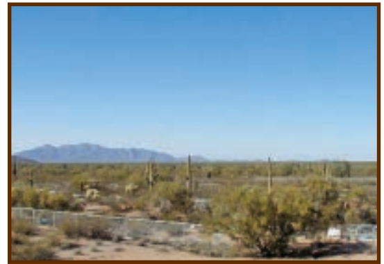
Main Field 2002

of pigs that were not able to thrive in such a big field. Tulley had epilepsy, Ellie Mae's legs were deformed, Fido was extremely terrified of everything and Travis Magee was old and slow moving. We decided to subdivide our large