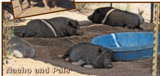
Nacho and Pals