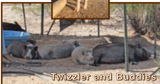
Twizzler and Buddies

The 3 pigs were running loose in Buckeye, AZ. A man caught them and took them to his uncle’s house while they tried to find a home for them. The youngsters were a bit thin but fortunate to not have any