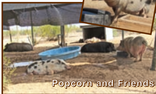
Popcorn and Friends

and Wilburt. Thanks to your generosity Nacho, Twizzler and Popcorn got the medical care they needed and now live in a safe environment with plenty of food and good friends. Thank you for giving them a happy life!